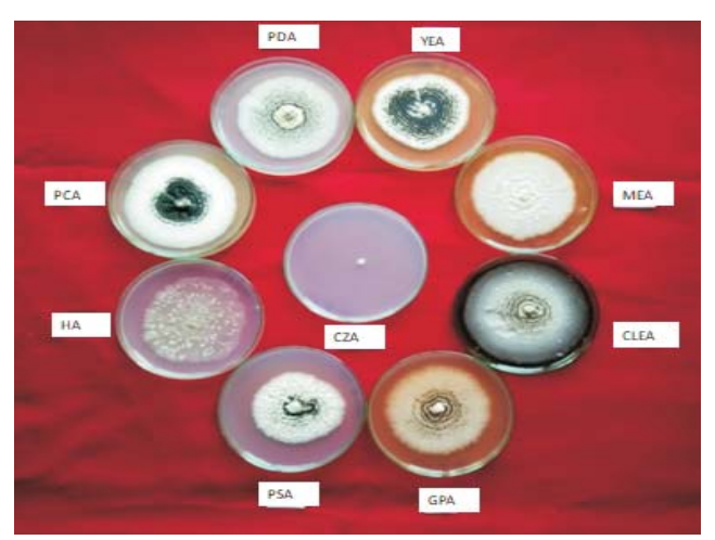
Figure 1: Effect of culture media on growth and sporulation of M . roridum

*Figures in parentheses are arcsine values; + + + + : Excellent (51–80 spores/MF), + + + : Good: (21–50 spores/MF), + + : Medium (11–20 spores/MF), + : Poor (5-10 spores/MF), - : No sporulation